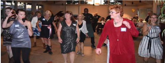
Below BIRW Board ready to Bling with President Trump smiling on!